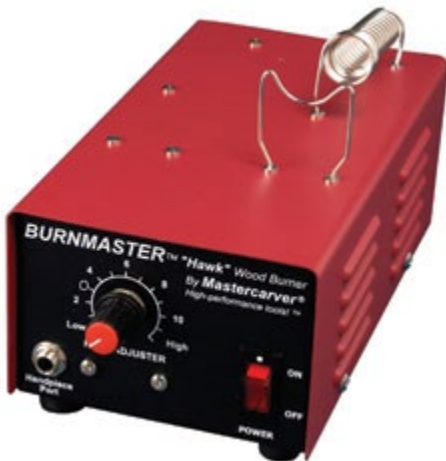
Image of the Burnmaster single port woodburner