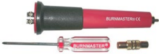
Image of Burnmaster handpiece that accepts wire tips