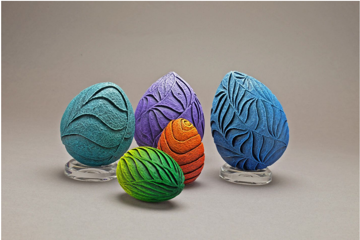
Wood Ffolkkes: 'Tweens

Demonstration # 2: Wood Ffolkkes: Adding Color and Depth. This session will be demonstrating creating the color palette, using the dry-brush painting technique. It should be noted that while techniques will focus on the Wood Ffolkkes sculpture, this technique can be used in many other ways, on multiple shapes and forms. Below are just a few examples: